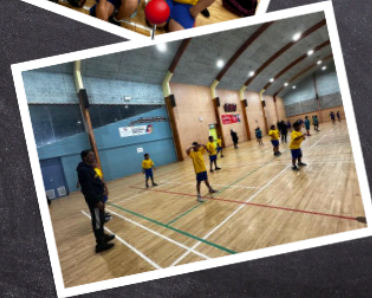
Congratulations to our Year 5/6 Volleball team who placed 3rd at the competition. They played with great sportsmanship and had a lot of fun.