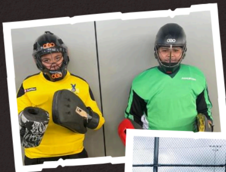
Our Tear 7/8 Girls hockey team advanced to the CCSA Year 7/8 Hockey Tournament.

The title of our garment is "La'ei taupou fausia mai i mea toe gaosia "